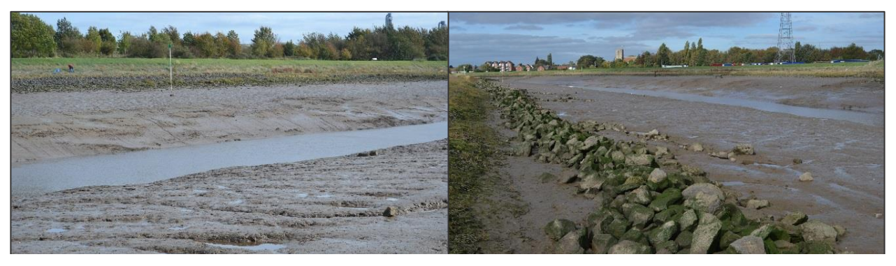
Plate 17-1 Mudflats adjacent to the Principal Application Site. Photographs taken by RHDHV on 8th October 2018.