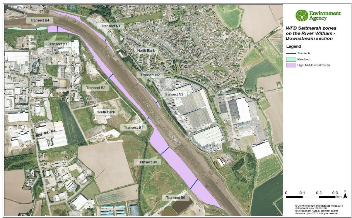
Plate 17-3 Saltmarsh areas surveyed by the Environment Agency – Transects B1 and B2 on the South Bank are the closest to the Principal Application Site.

17.6.12 The most recent survey (Holden, 2017) recorded 18 saltmarsh species in 2017, compared to 19 in 2014 and 17 in 2011 (Plate 17-3, Figure 16.3). The two transects taken in 2017, classified the saltmarshes to the north of the Project as SM13a Puccinellietum maririmae saltmarsh, Puccinellia maritima dominant subcommunity (mid-low marsh), SM24 Elymus pycanthus (Elytrigia atherica) saltmarsh, dominated by Elytrigia atherica (high marsh) and SM10 transitional low marsh vegetation with Puccinellia maritima, annual Salicornia species and Suaeda maritima (Joint Nature Conservation Committee's (JNCC) National Vegetation Classification). The saltmarshes to the south of the Project site were classified to be SM16d tall Festuca rubra sub-community (high marsh), SM13a Puccinellietum maritimae saltmarsh, Puccinellia maritima dominant subcommunity (mid-low marsh), SM13d Puccinellietum maritimae saltmarsh, Plantago maritima-Armeria maritima sub-community (mid-low marsh) and SM10 transitional low-marsh vegetation with Puccinellia maritima, annual Salicornia species and Suaeda maritima.