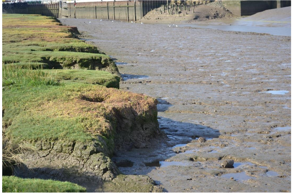
Plate 17-5 Erosion of the saltmarshes upstream of the location of the Principal Application Site.