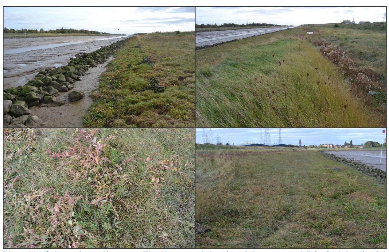
Plate 17-2 Saltmarshes adjacent to The Haven and the site of the proposed Principal Application Site.

17.6.11 A survey carried out in 2011 near the location of the proposed wharf defined the saltmarshes as of poor quality due to the limited extent, low diversity and